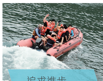
追求進步 Pursuing advancement