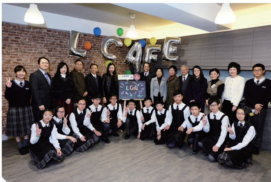
LCafe 結合學習 (Learning)、語言 (Languages) 及關愛 (Love) 三重意義