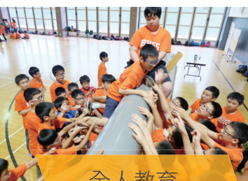
全人教育 Holistic education