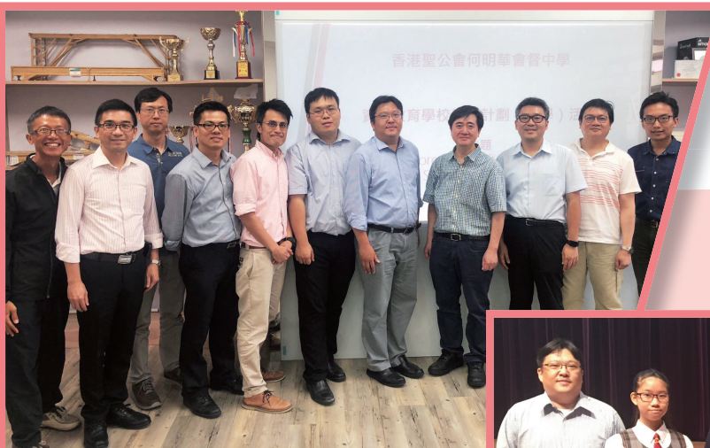
本校教師參與教育局資優教育學校計劃分享日