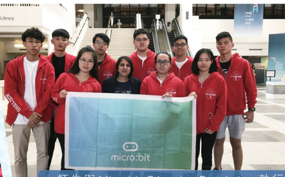
師生與 Micro:bit Education Foundation 執行總裁 Kavita Kapoor 會面