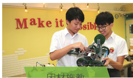
因材施教 Catering diversity