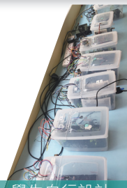
學生自行設計 10 個智能盆栽