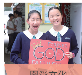
關愛文化 Love & Care