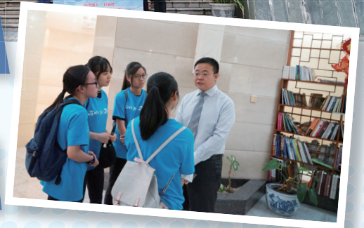
學生聆聽中國駐斯里蘭卡外交人員的講解