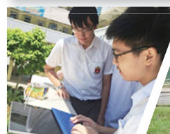
學生自製空氣 污染監測儀