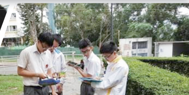
在不同的地方進行空氣檢測研究